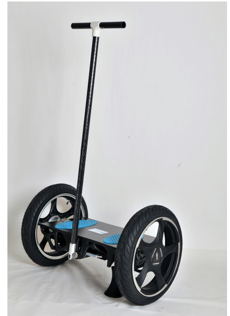
The finished self-balancing scooter designed and manufactured by the University of Applied Sciences Ravensburg-Weingarten.